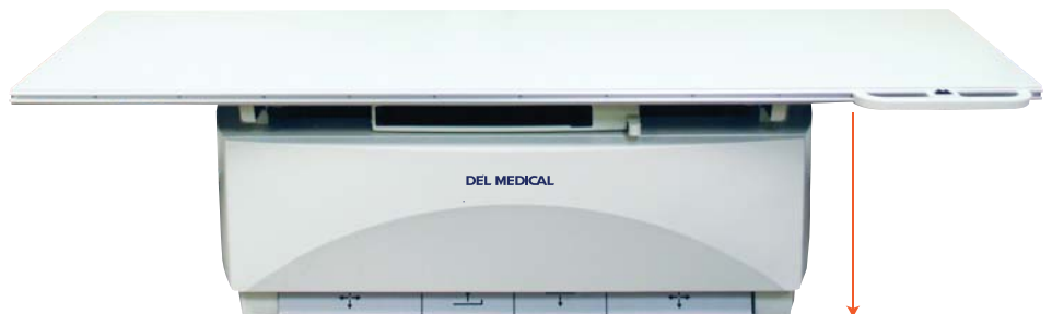
Table top lowers to 22.25"(56.5cm) allowing for safe and easy patient transfers