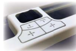
Table side hand control provides additional source for all table movements