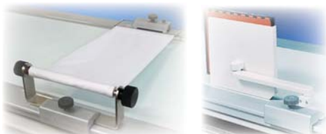
Optional compression band and lateral cassette holder