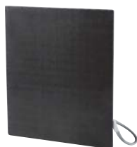
14" x 17" Portable