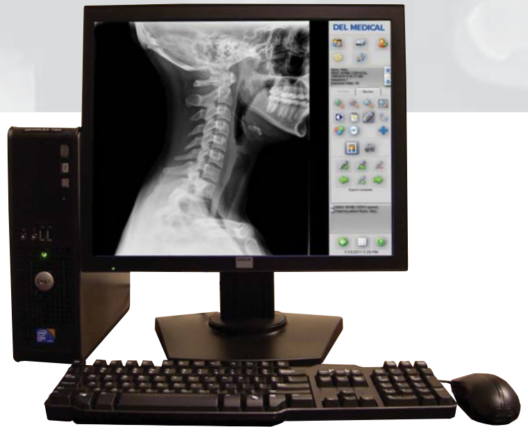
Display rotates to landscape or vertical.

The Dell Optiplex 780 small form factor desktop PC provides a stable platform required for medical imaging applications with a small footprint for easy installation into existing control room settings. Equipped with Intel Core 2 Duo 3.0 Ghz processor, 4GB RAM, and a 250GB hard drive to ensure optimal performance and productivity.