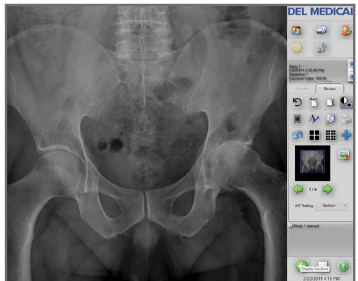
Superior image quality.