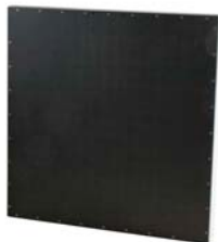
17" x 17" Fixed