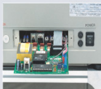
Mainboard on JP-33 All functions controlled by microprocessor on mainboard

* This specification is subject to change without notice.