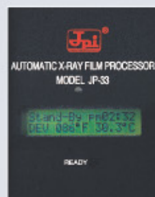
The Control Panel Displays working status, and provides easy-control of all functions and settings.